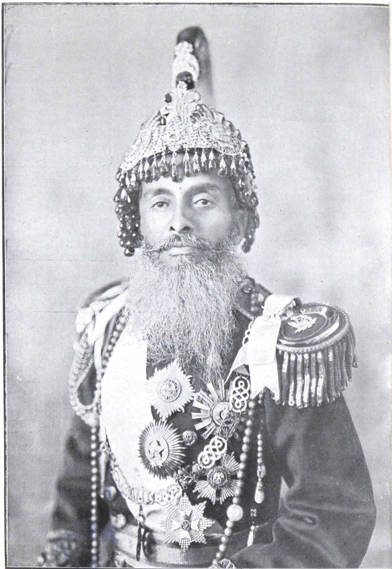
H. H. MAHARAJAH OF NEPAL.